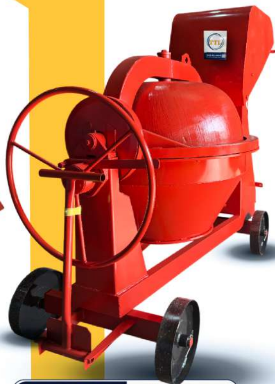
Cast Iron Material Heavy Duty