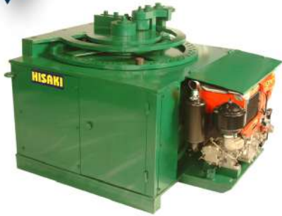
HISAKI BAR BENDER 32mm