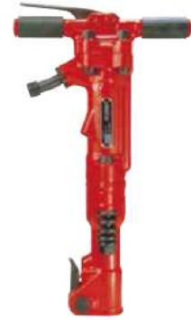
AIR BREAKER - TPB 60