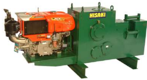
HISAKI BAR CUTTER 32mm