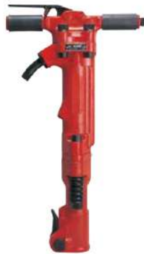
AIR BREAKER - TPB 73