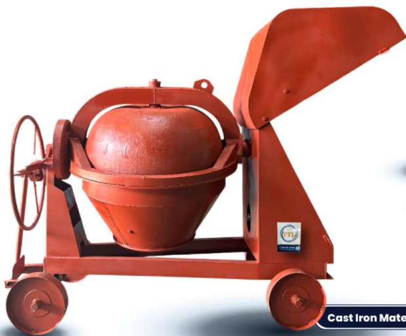
Cast Iron Material Standard Duty