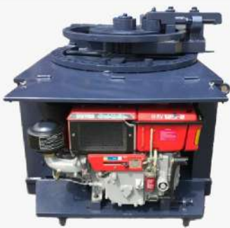
HISAKI BAR BENDER 42mm