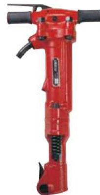
AIR BREAKER - TPB 90