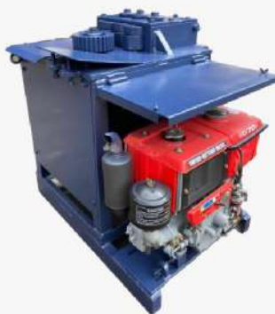
SPIRAL RING BENDER 20mm