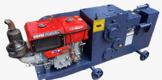
HISAKI BAR CUTTER 42mm